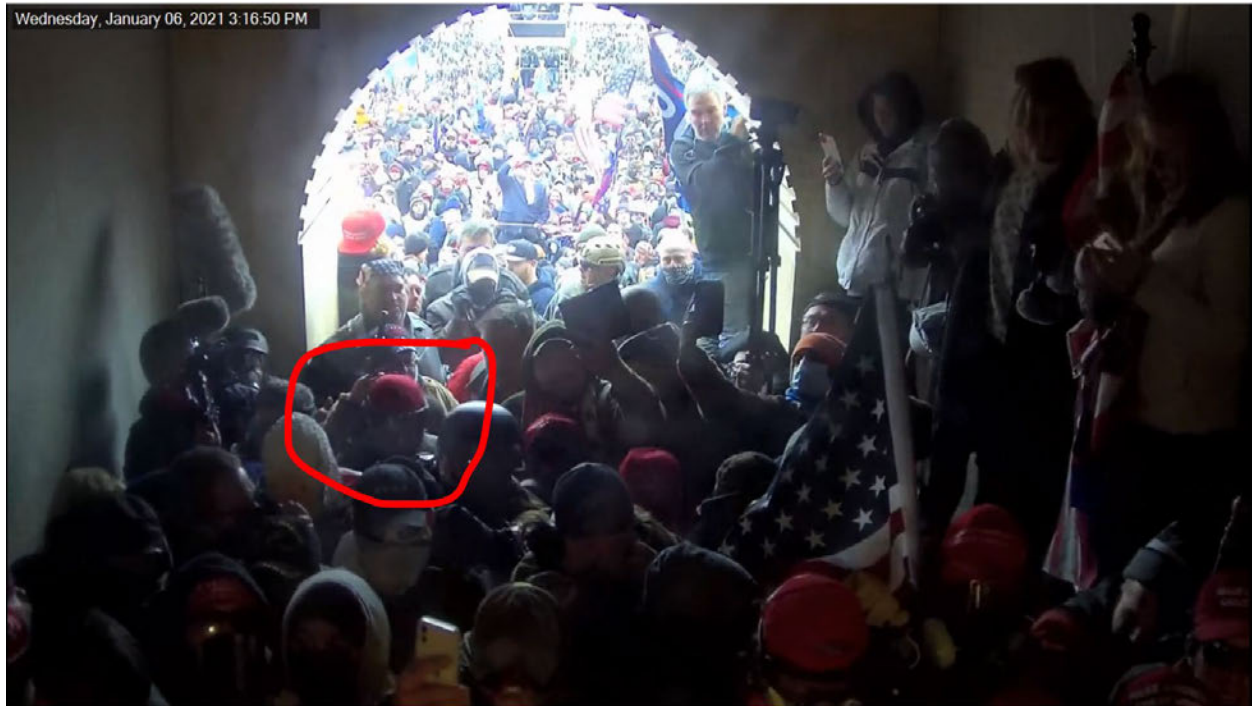
image from CCTV depicting AFO 235 pushing against other rioters as the crowd moved together against the police:

At approximately 3:19 p.m., the police successfully cleared the tunnel of rioters and pushed the rioters, including AFO 235, out of the tunnel and onto the LWT. AFO 235 remained at the police line for several seconds and clung to the edge of the tunnel entrance in an effort to resist the police push.